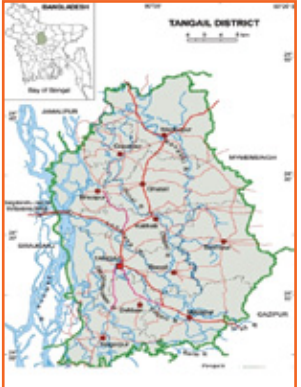
Figure 1: Map of Tangail District

The total population of Tangail District is about 3.2 million, and the intervention covered about 2.8 million people in the eight upazilas. The total estimated number of live births in the eight selected upazilas was 21,834 per year (see Appendix 1), of which approximately 18,559 deliveries were estimated to occur at home (85%, as per the 2007 BDHS).