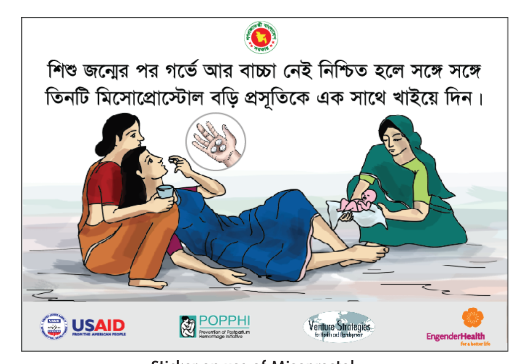
Sticker on use of Misoprostol