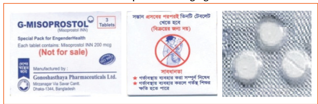
Misoprostol catch cover and three tablets