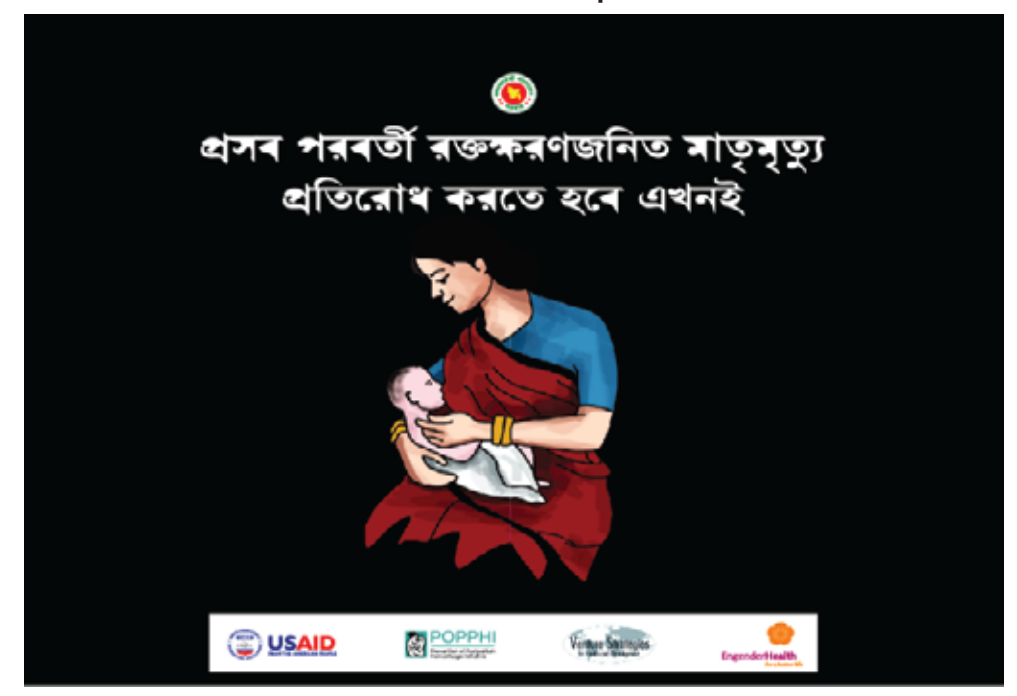
Flipchart on use of Misoprostol