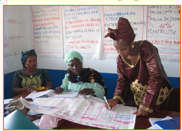
Health care providers in Labé developing an action plan during the training.

indicated strong agreement). The lowest average rating (3.8) was for the statement: "Five days of training were sufficient to learn how to offer quality services to survivors of sexual violence." The statement with the highest average rating (4.9) was: "I will put into practice what I learned in training." All of the other statements received ratings above 4.4. In addition, participants rated the quality of each training session on a scale of 1 (minimum) to 5 sessions (maximum). A11 received a rating of at least 4.4.