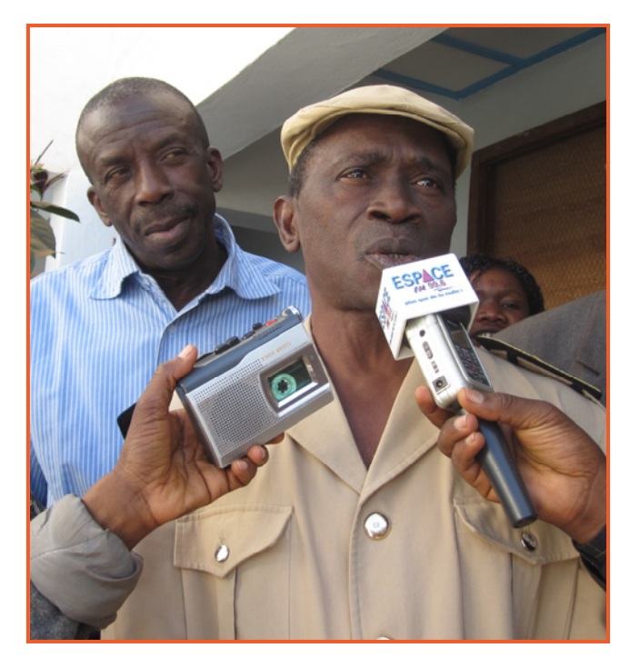
The Governor of Labé, Mr. Sadou Keita (right), presided over the closing session of the health care provider training. The session was broadcast on Guinean national radio.

Following the two trainings of health care providers, RESPOND improved the curriculum based on feedback from providers and facilitators. The MOH led a workshop to revise and validate the provider curriculum. RESPOND is making the final formatting changes suggested, and the MOH will adopt the curriculum as its own national SV curriculum. Previously, the MOH had a protocol for the care of SV survivors, but no curriculum for training providers. The MOH is seeking support to scale up training across the country with this curriculum.