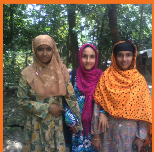
Three peer educators of Mirzagonj, Patuakhali

As in many developing countries, providing FP and reproductive health services to the poor and vulnerable, including YMCs, is a high priority in Bangladesh, where adolescents represent one-fourth of the population. Mayer Hashi's YMC intervention was a community-based intervention with special focus on the use of long-acting FP methods in the context of informed choice, to help meet the reproductive intentions of this specific target audience. It was implemented by and in close collaboration with the DGFP, which has already expressed great interest in scaling up the intervention in other low-performing districts. Mayer Hashi has already initiated this process in two districts, using the lessons learned from Patuakhali District. EngenderHealth is also looking into opportunities to expand the scope of the intervention and add a focus on delaying early marriage and first birth. This work will include activities to enhance the enabling environment and create demand for services, as well as improve the quality of services offered to young men and women. Over the next months, EngenderHealth will work closely with the DGFP and other partners to develop modalities to further scale up the intervention across the country, to help ensure that young men and women in other areas have access to FP information and services, can lead a healthy life, and can achieve their full potential.